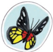
Red Base Jezebel

This critter is known for its vibrant crest and striking appearance.