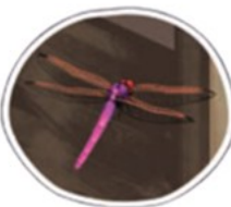
Dawn Dropwing Dragonfly

The females of this species are somewhat larger than the males. This frog is usually a light gray color but can also be brown or a dark red color, and in some cases bright yellow.