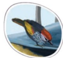
Vietnamese Gold Winged Laughing Thrush

These strikingly beautiful dragon flies are commonly referred to as "Chasers." It is a common species in most countries in the Indian subcontinent and southeast Asia.