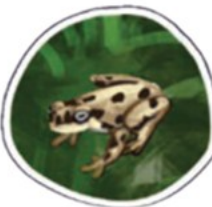
Annam Flying Frog

The species is found in parts of South Asia and Southeast Asia. their Chinese common name which means "Announcing Good News".